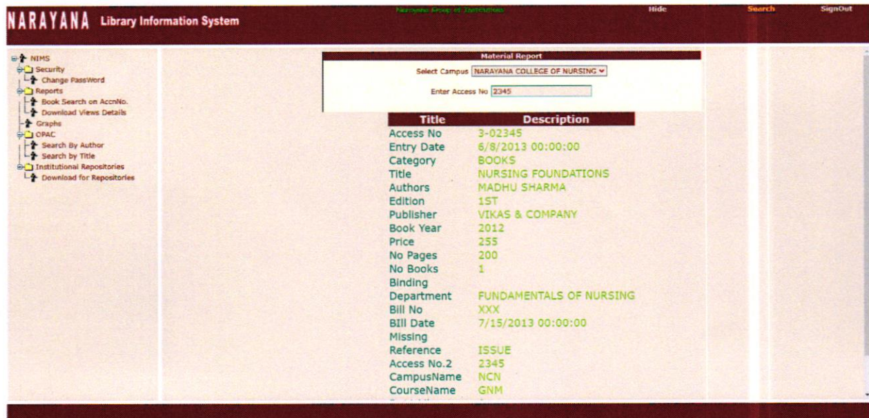
Search Access Number in OPAC